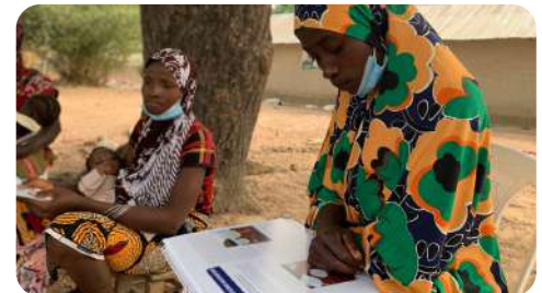
A mentee in Gwam Ward studying her flipchart during a session