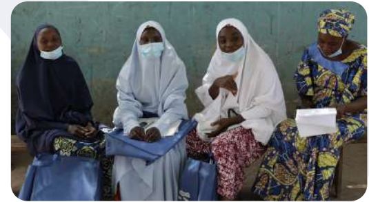
Kafee joined other mentors in Bida community to prepare for an impact session

Spreading the knowledge of vaccination and its benefits, and how to navigate challenges across low vaccination communities remains one key sustainability element for the LEOPOD intervention to record more meaningful stories towards bringing about a change in behaviour and norms.