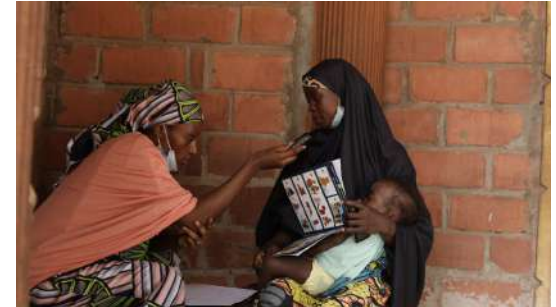
A LEOPOD trained facilitator collecting responses from a beneficiary outside the Cheche's palace