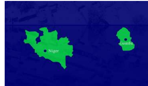
Map of Nigeria showing implementing States