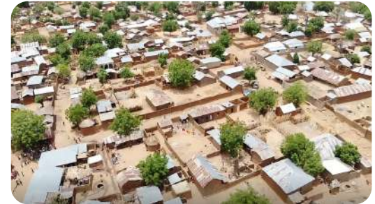
Daban Fulani Community

As some go on to complete immunization for their children, more family members indicated they would join. This thus sustains the project beyond its implementation and exit phase.