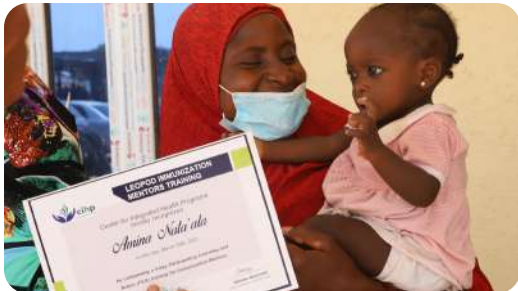
A mentor carrying her child poses with her certificate

Now leveraging on the benefits of vaccination after learning about it THROUGH the LEOPOD Project, caregivers of non-fully Immunized Children in Niger and Gombe States have certificates to show for this. Issued by Center for Integrated Health Programs (CIHP), they belong to the LEOPOD immunization mentee cohort on social behavioural change (SBC) participating in the 5 months SBC program.