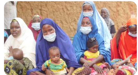
More caregivers joining the project