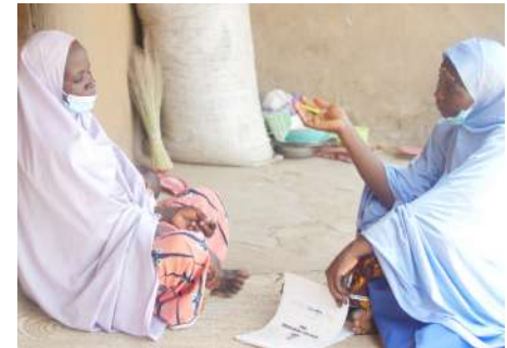
A LEOPOD home visit session in Kaltungo LGA, Gombe using the Home Visit monitoring tool

Many mentees across the project's implementation locations who did not commence vaccination early were reached through home visits averaging 7 over a course of 2 months and emphasizing the importance of vaccination to the caregivers as well as serving as a means of encouragement towards the larger aim of reducing child mortality in Africa.