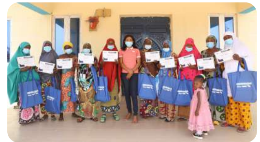
LEOPOD coordinator and LEOPOD Beneficiaries

80% of Immunization Mentors who participated in the exit interviews indicated a willingness to continue as an immunization mentor in the community. 91% of the target group had also demonstrated strong intentions to continue vaccination. And post intervention having been given certificates, 84% of the target group demonstrated increased knowledge about immunization.