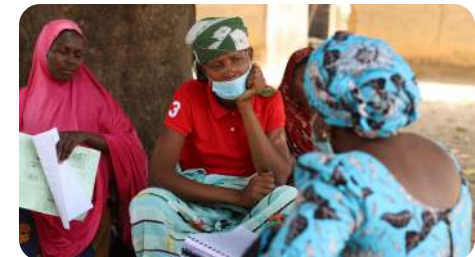
Caregivers participating in LEOPOD sessions in Anguwan Kwanayi