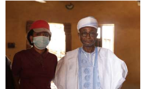
LEOPOD project Coordinator and Cheche district head in Bida