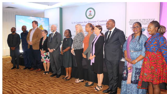
Group photo of IP, CDC, and PEPFAR

During the event, CIHP was recognized with an award of Public Health Excellence for her innovative approach to HIV case finding and linkage to ART. Awards were also presented to Gombe and Lagos states (two of the four states) where CIHP implements.