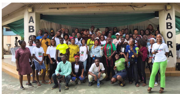
A group photo of adolescents during the IAHW 2023 commemoration

On the 28th of March, CIHP hosted adolescents in Lagos to a one-day activity in celebration of the International Adolescent Week (IAHW 2023).