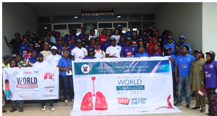
A group photo of participants in Lagos during the World TB Day commemoration

In Lagos, Kogi and Gombe for instance, the world TB day event further strengthened collaboration and synergy between CIHP, state ministry of health and other stakeholders.