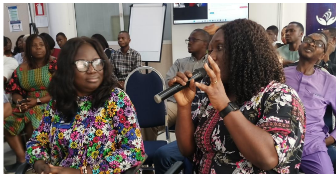
Contribution from participants at the event

Participants at the event also shared their experiences citing possible ways the society can adopt equitable policies and practices that would erode gender biases. In line with the International Women's Day theme, participants were encouraged to embrace equity.