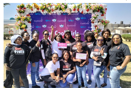
Cool Girls Kaduna

Developed to empower AGYW on sexual and reproductive health issues for HIV prevention and treatment support, the Coolgirls program presents a non-judgmental safe space where they can Dream, Aspire, Evolve and Reboot through Mentorship, Engagement and Empowerment "DARE to be MEE"