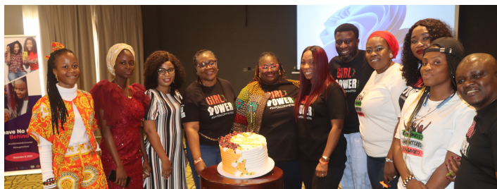
Group photo of participants at the #CoolGirls round table series

With adolescent girls and young women across Lagos brought together, the event also had in attendance different stakeholders including representatives of National Agency for the Control of Aids (NACA) and the US Centers for Disease Control (CDC), who gave goodwill messages and commended CIHP for the laudable innovation and continued impact in the society at large.