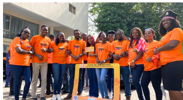
Staff commemorating orange the world activity in world activity

In Gombe state, there were massive sensitization rallies across its entire clusters, with a spotlight on Bajoga, a community in Funakaye LGA with high incidence of GBV against women and girls. The rally held in collaboration with law enforcement agents, community leaders and Union of commercial motorbike riders.