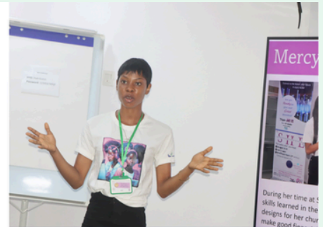
A Tech girl during her presentation.