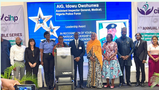
Group photo of stakeholders at the 4th Scientific Roundtable Series

This year’s 4th Annual Scientific Roundtable Series focused on addressing the intersecting vulnerabilities of adolescents, recognizing the need for more holistic and inclusive solutions. Guided by the theme, ‘The Missing Link: Reducing Vulnerabilities of Adolescents and Young Persons through Sustainable Interventions’, the event convened key stakeholders to discuss innovative and sustainable strategies aimed at mitigating these challenges. By fostering collaboration among experts, policymakers, and community leaders, the forum sought to identify practical approaches that address the unique needs of adolescents and young persons, ultimately working towards reducing their vulnerabilities and enhancing their resilience.