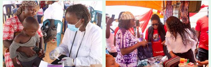
Sights from the Kuchingoro outreach and funfair

Our partnership with the French Embassy is a testament to CIHP's dedication to improving health and building strong relationships.