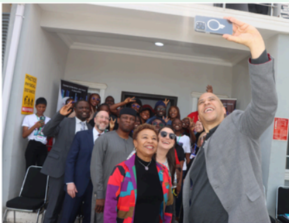
Senator Cory Booker taking a quick selfie with the girls at the Hub.

CIHP remains grateful to PEPFAR and the U.S CDC, for their continuous support, which has been instrumental in driving our mission to empower the next generation of female innovators.