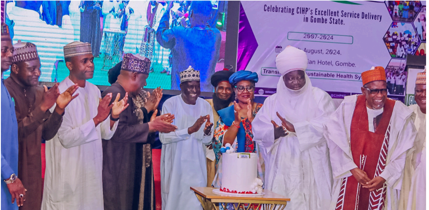
A cheerful moment of stakeholders during the cutting of the closeout ceremony cake