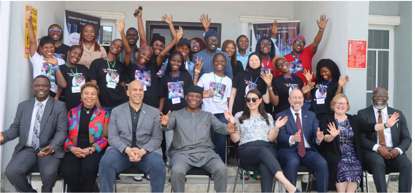
A group photo of US CDC team, CIHP team, and the STEM girls during the visit of Senator Cory Booker to STEM Hub

CIHP was honored to host a distinguished delegation from PEPFAR, which included US Senator Cory Booker from New Jersey and Congresswoman Barbara Lee, among other esteemed personalities from the United States of America, at our STEM Hub for Empowerment of Young Women.