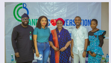
Group photo of panellists to at the CCWBO Abuja