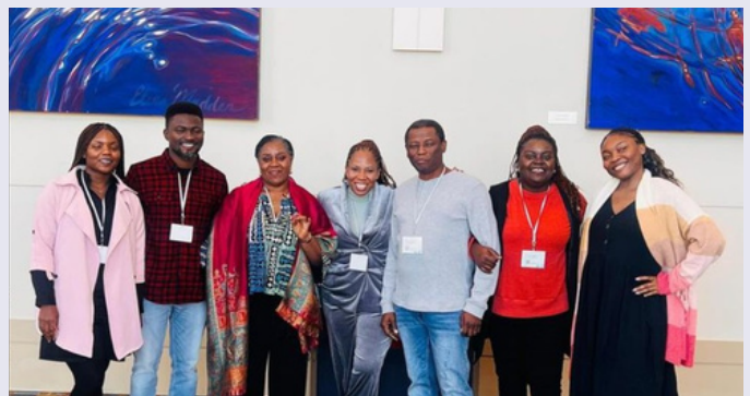
A group photo of CIHP team at the 5th Big Data Conference