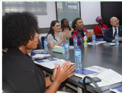
The PEPFAR team applauding the girls' presentations.