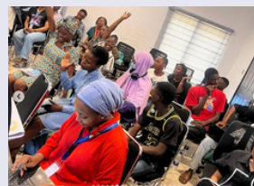
CCWBO session with adolescents in Lagos

The "Candid Conversations with Bola O." series continues to provide a safe space for open discussions on key social and economic issues, offering participants valuable knowledge and practical advice.