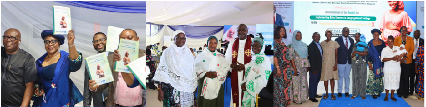
Picture highlights from the Baby Showers Toolkit Launch.

By engaging religious leaders and communities, we are paving the way for a healthier future through increased support for pregnant women and their partners.