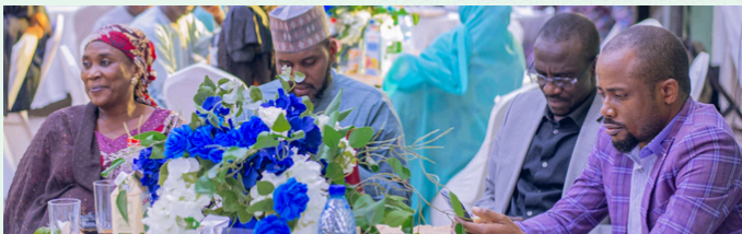
A session of participants at the closeout ceremony

For the past 17 years, CIHP has played a key role in the fight against HIV in Gombe State, Northeastern Nigeria. This journey of dedication, innovation, and resilience has remarkably transformed the state's healthcare landscape, moving it to one of the states in Nigeria that has achieved HIV epidemic control and a sustainable health system.